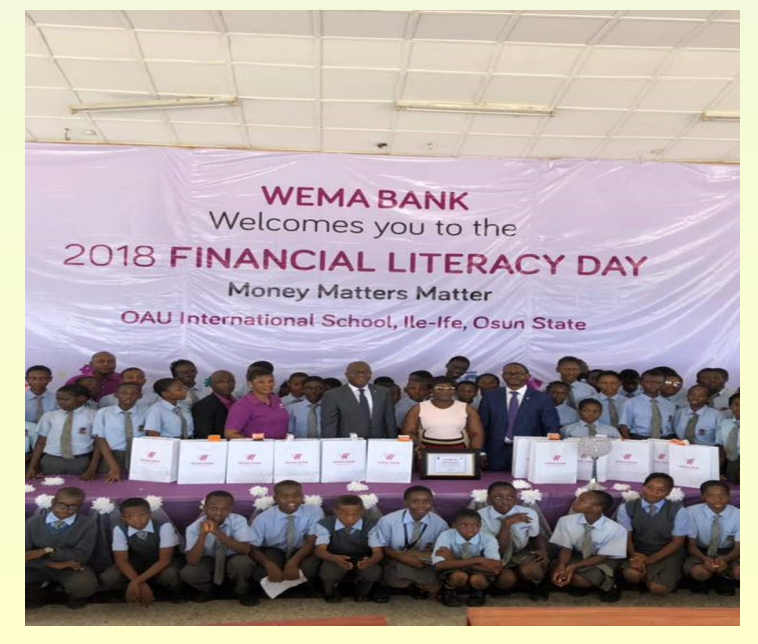
Students at Wema Bank During financial literacy day