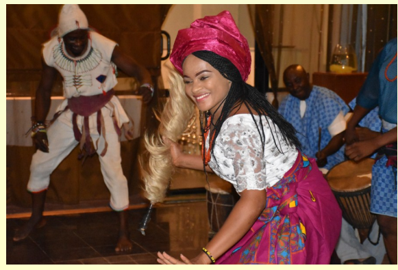
Reception and Nigerian Cultural Displays for the Delegates