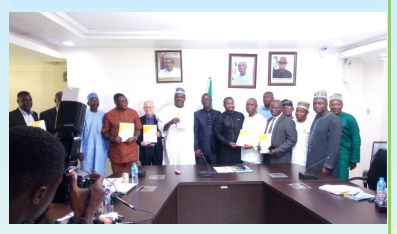
Participants at the Launch of The Roadmap for Evidence-Based Insurance Development For Nigerian Farmers at Federal Ministry of Agriculture & Rural Development, Abuja

As part of efforts to support the contribution of agriculture to the Nigerian economy, the Federal Government launched a Climate Insurance framework titled "A Roadmap for evidence-based Insurance Development for Nigerian Farmers" in December, 2017.